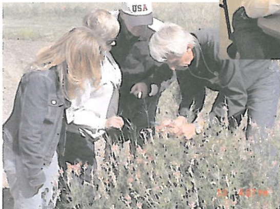
Student at the Summer Institute learn about the diversity in agriculture. These pictures show them preg checking cow, learning about plant research at CSU ARDEC Research Center and learning how to build mini-greenhouses for their classroom.